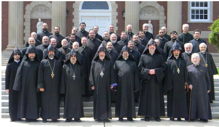
The participants of the Annual Clergy Conference held in Chicago, IL prior to the Diocesan Assembly earlier this month.

Correction: Inadvertently, a photo was omitted on the cover of the May Torchbearer . Please refer to the parish website to see the photo of the group of girls who participated in the Tuesday evening Great & Holy Week services remembering the Wise and Foolish Virgins. We apologize for the mistake.